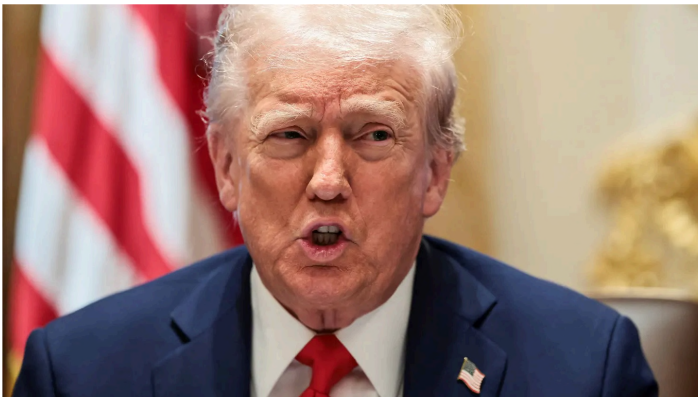
U.S. President Donald Trump speaks during a cabinet meeting at the White House in Washington, D.C., U.S., Oct. 9, 2025.

It was not immediately clear which programs Trump had in mind, but he specified that they were “very popular Democrat programs that aren’t popular with Republicans, frankly.”